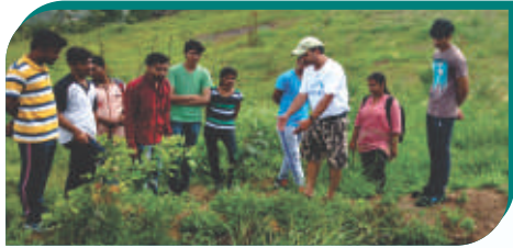
Introduction to CCT and regular activities