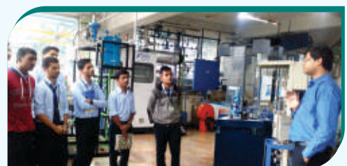
Visit to Forbes Marshall