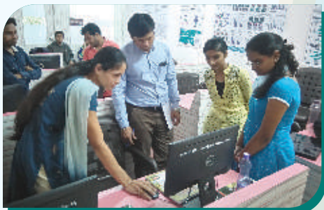
Project Based Learning