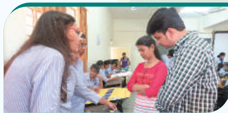
Smart City (Poster competition)