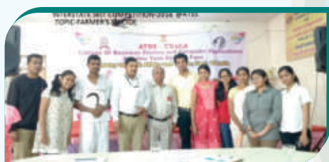
MCA Students Participate