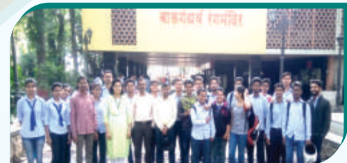
Visit to Balgandharv Rangmandir