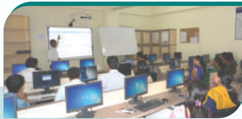
Workshop on Big Data Hadoop