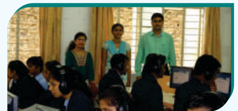
Soft Skill Lab Activity