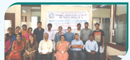
System Design flow using Zynq