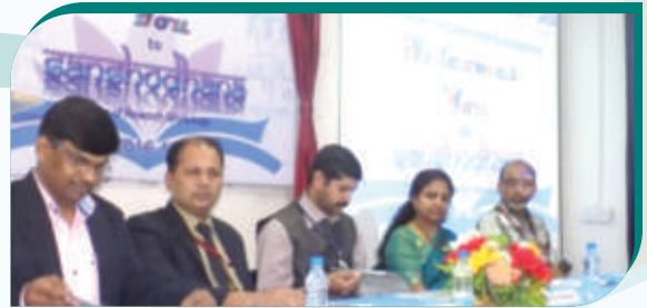
A Sanshodhan - Research Workshop