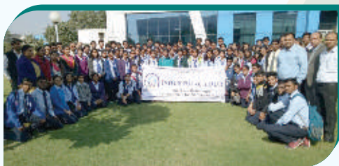
Delphi Automotive Systems Pvt. Ltd.

Spiritual and historical places visited: Golden Temple, Jalianwala Baugh and Wagah Boarder at Amritsar; Red Fort, Lotus Temple, Akshardham temple, India Gate, Rajghat, Rashtrapati Bhavan, Parliament, Delhi Secretariat at Delhi; TajMahal & Fatehpur-Sikri at Agra.