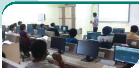
STAAD Pro Masters Training