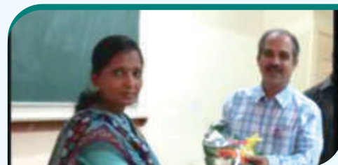
Guest lecture on Principle Stresses