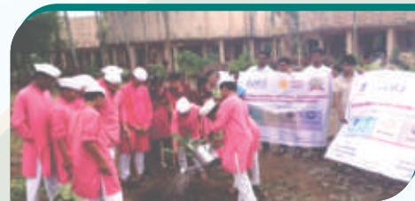
MCASA Reformation Ceremony on 17 th October, 2016