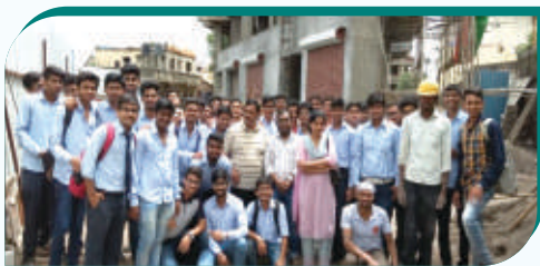
Site Visit of S.E Students at Aum Vihar Site