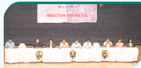
FE Induction Programme

Aptitude Cracker Event for S.E, T. E. and B. E. civil students was arranged on 20 th September 2016 by Civil Engineering Student Association (CiESA). Total 150 students participated in the event.