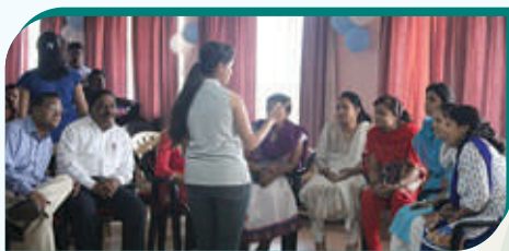
Teacher's day celebration by Student's Association of all departments