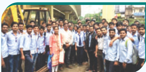
Site Visit of B. E. Students at J.R.D. TATA Flyover