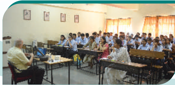
Session on Cyber Security