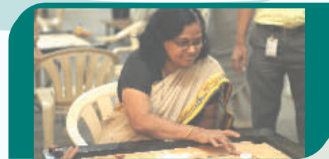
F.E HOD During The Event