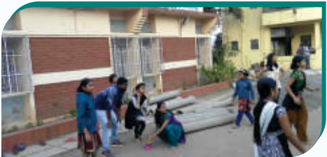
Visit to Child Orphanage Aniket Niketan by E & Tc Department on 31 st December 2016