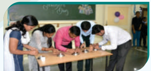
Teacher's day celebration by Student's Association