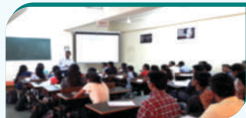
Basics of Programming and communication skills