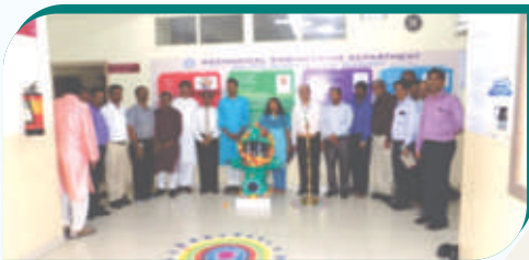
Hand over ceremony