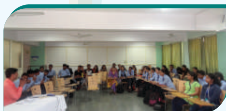
Soft Skill - Presentations