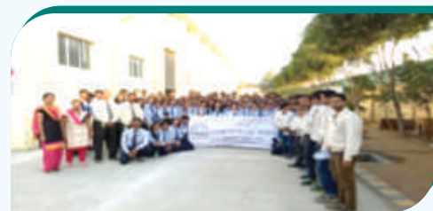
Lorom India Corp. Pvt. Ltd.