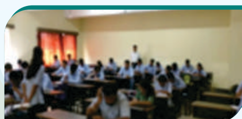
Aptitude Cracker Event

Aptitude Cracker Event for S.E, T. E. and B. E. civil students was arranged on 20 th September 2016 by Civil Engineering Student Association (CiESA). Total 150 students participated in the event.