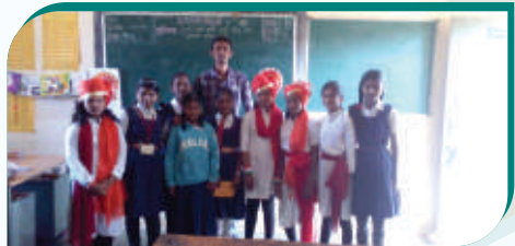
Natyaprashikshan- an act to introduce the students to arts by E & Tc dept.