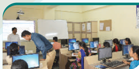
Participants during the workshop