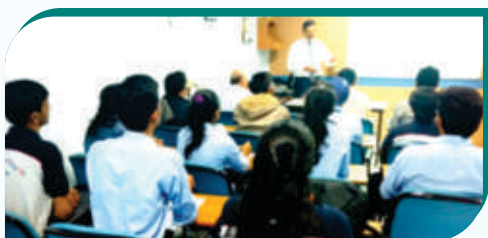
Sessions on Low Cost Automation at SMC Pneumatics India Pvt. Ltd.