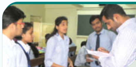
Poster Competition on Routing Protocols