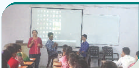
Team Building Games