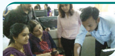
Model making competition