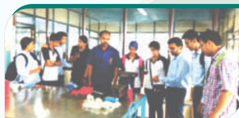
Demonstration of working of Hydraulic Pump