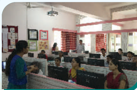
A Workshop on Software Testing