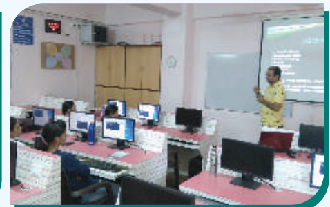
IBM Web Sphere Message Broker Application Development