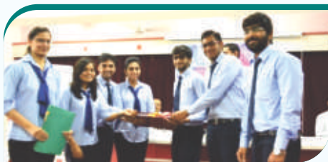
CESA Induction Ceremony on 11 th July 2016.