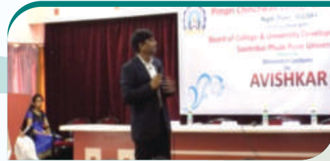
Research and Innovations (Avishkar 2016)