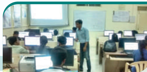
AutoCAAD software Training