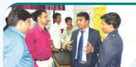
Poster Presentation Competition