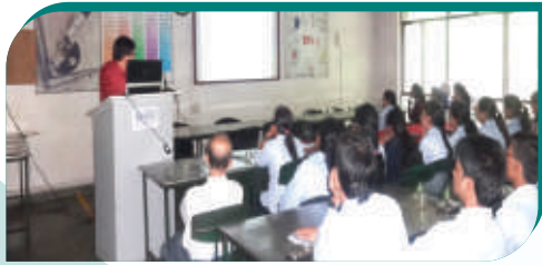
Visit to M/s. Baker Gauges (I) Pvt. Ltd. Pune