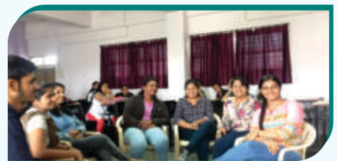
Group Discussion on 27 th August 2016 for MBA first year students