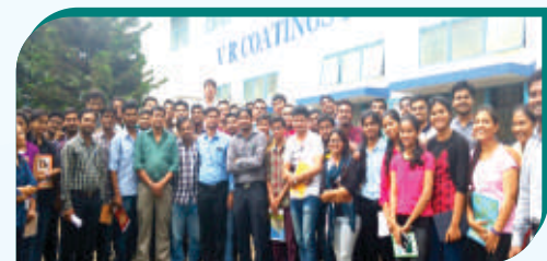
Visit to V. R. Coatings Pvt. Ltd Bhosari