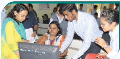
Data Mining using Weka