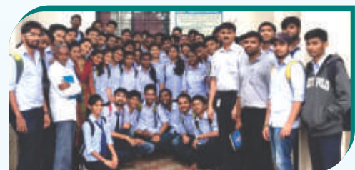
Site Visit of B. E. Students at WTP, Nigdi