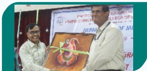
Induction Program - 2016