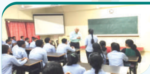
Career opportunities in Civil Engineering