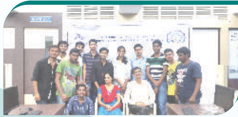
Raspberry Pi and its applications in Internet of Things