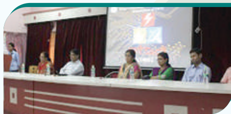
ETSA Inauguration Ceremony on 19 th July 2016.