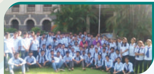
Visit of T.E Students at IMD, Pune