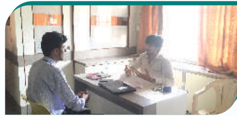
Mock Technical Interviews