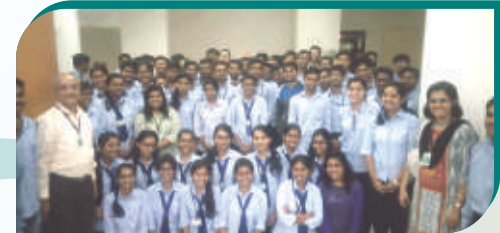
Visit to ARAI