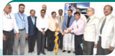
Inauguration of Product Innovation lab