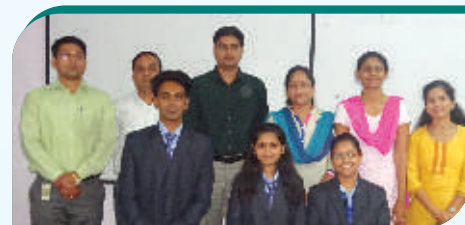
MCASA Reformation Ceremony on 17 th October, 2016