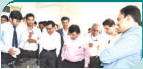
Demonstration by students