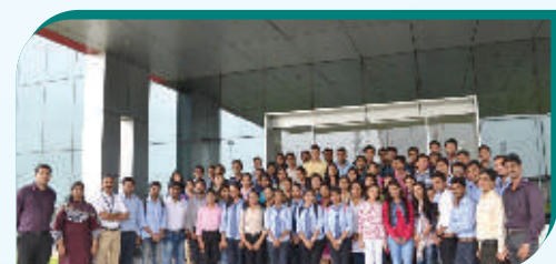
Visit to Lear Automotive Pvt.Ltd.,Chakan