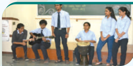
Guru Pournima celebration by Student's Association of all departments