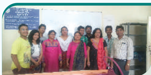
Two Days Workshop on CNIS