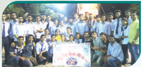
Nirmalya Collection in coordination with PCMC on 15 th September 2016.