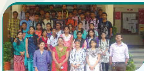
Career Readiness Program