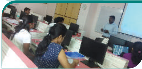
Entrepreneurship Initiatives and Innovation