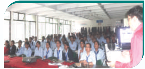
Visit to M/s. Baker Gauges (I) Pvt. Ltd. Pune