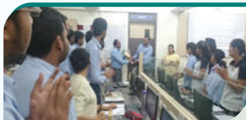
Hands – on Real Time Operating Systems