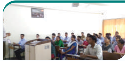
Soft Skills & Personality Development