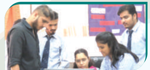
Web-O-Mania on theme Digital India