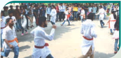
"Rally on Road Safety" on 28 th September 2016