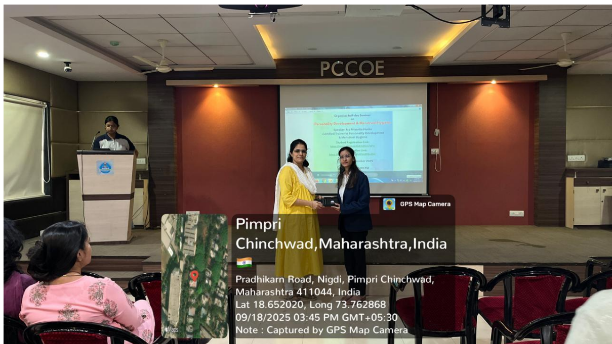
The felicitation of the speaker by ICC In-Charge

Such awareness sessions play a vital role in nurturing holistic development and promoting health and confidence among young minds.