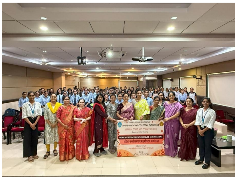
The group photo of workshop on “Women Empowerment “