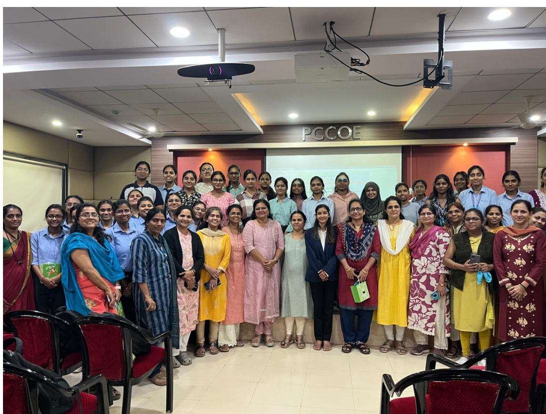
Group photo of event