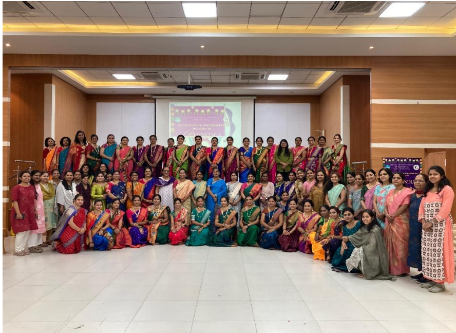
Group photo of the event