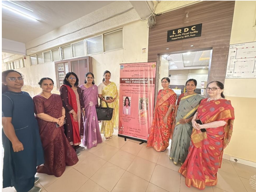
The SPPU-funded workshop on “Women Empowerment “