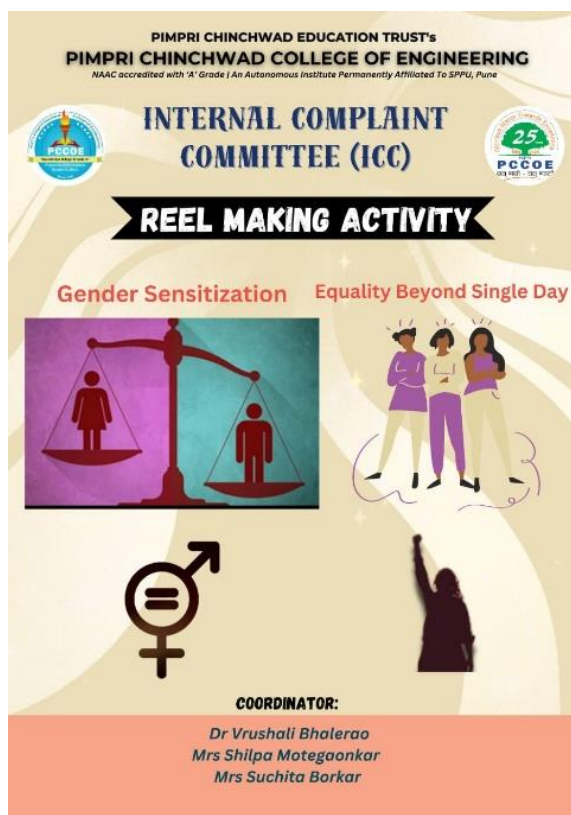
Flyer of the Event: “Reel making activity “