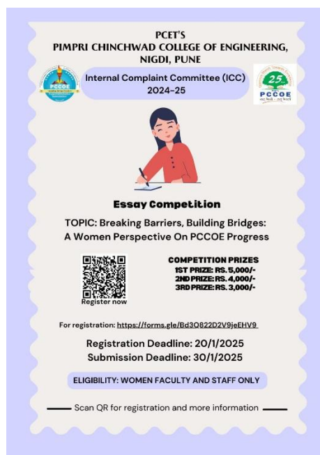
Flyer of the Event : ICC Essay Competition