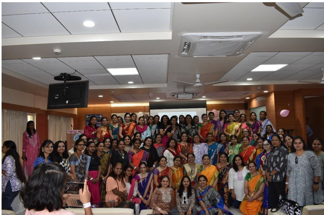
International Women's Day Celebration 2025, Group Photo