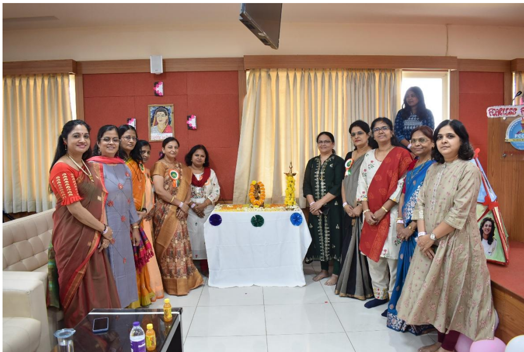
International Women's Day Celebration 2025, Saraswati Pujan

This activity was coordinated by all ICC Members and ICC student volunteers.