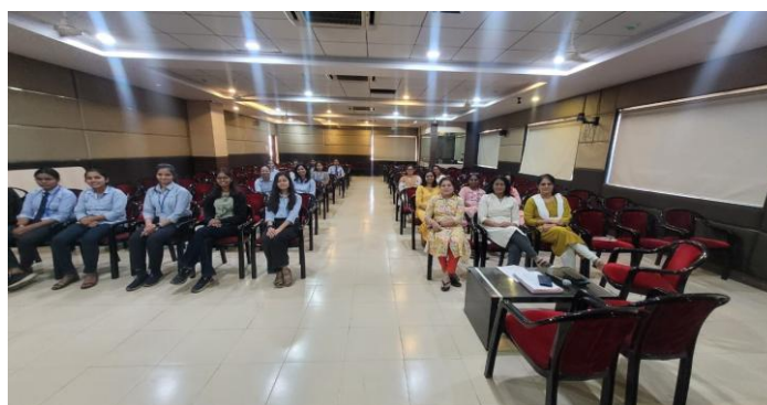
Event: “POSH Act Quiz Competition “ at Mechanical Seminar Hall