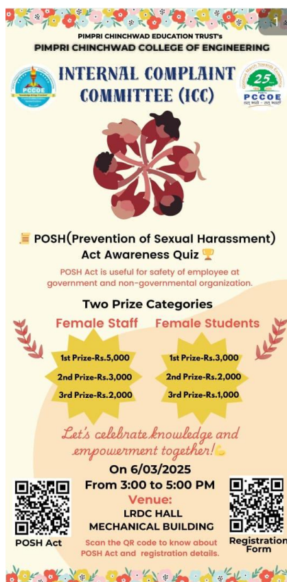
Flyer of the Event: “POSH Act Quiz Competition “