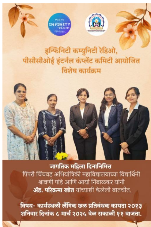
“Legal Awareness About Women’s Safety at the Workplace” floated on Radio 90.4 FM